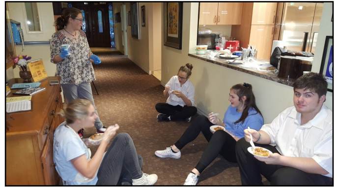
BeSTY members take a break from helping at the congregation 2nd night Seder.

Information regarding the confirmation program will be forthcoming in future publications.