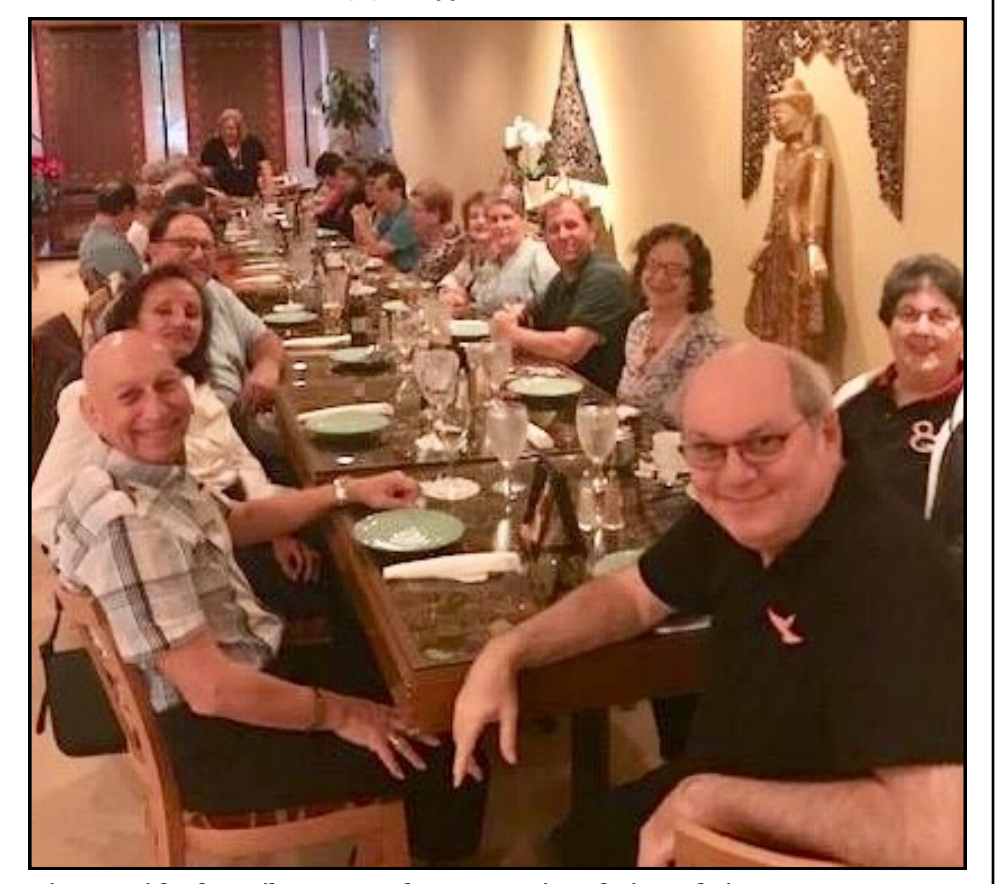
Dinner With The Tribe ate together at Jasmine Thai on Christmas.