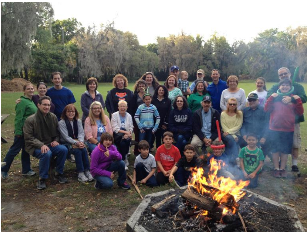
Congregants enjoyed a sunset Havdalah service followed by campfire songs, and of course s'mores, at the Second Annual CBS Retreat at Cedarkirk Camp and Conference Center.